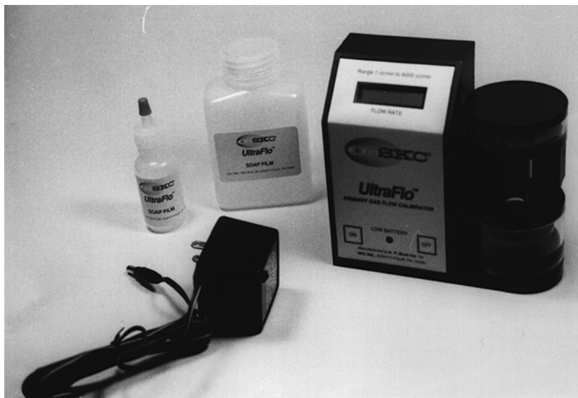
UltraFlo CALIBRATOR® PACKAGE